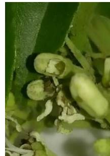
Fig.3. Hole made on lateral side of a flower bud of Murraya koenigii by Anthene lycaenina larva.