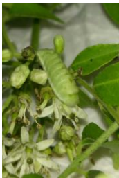
Fig.4. Anthene lycaenina larva feeding on an open flower of Murraya koenigii . 07.iii.2021