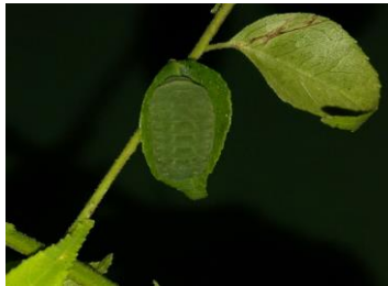
Fig.5. Anthene lycaenina larva (dorsal view) on leaf of Murraya koenigii . 08.iii.2021