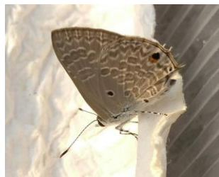
Fig.8. Eclosed adult Anthene lycaenina . 15.iii.2021.