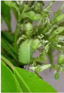
Fig.1. Anthene lycaenina larva feeding on a flower bud of Murraya koenigii . 07.iii.2021