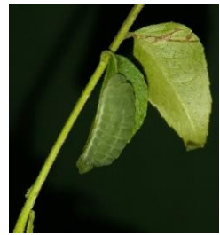
Fig.6. Anthene lycaenina larva (lateral view) on leaf of Murraya koenigii . 08.iii.2021.