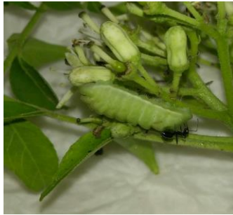
Fig.2. Anthene lycaenina larva feeding on a flower bud of the inflorescence of Murraya koenigii . 07.iii.2021.